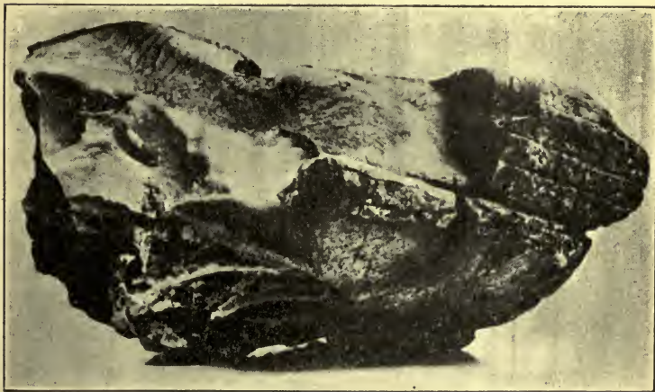
Large mass of Nehalem wax. Portland City Museum.