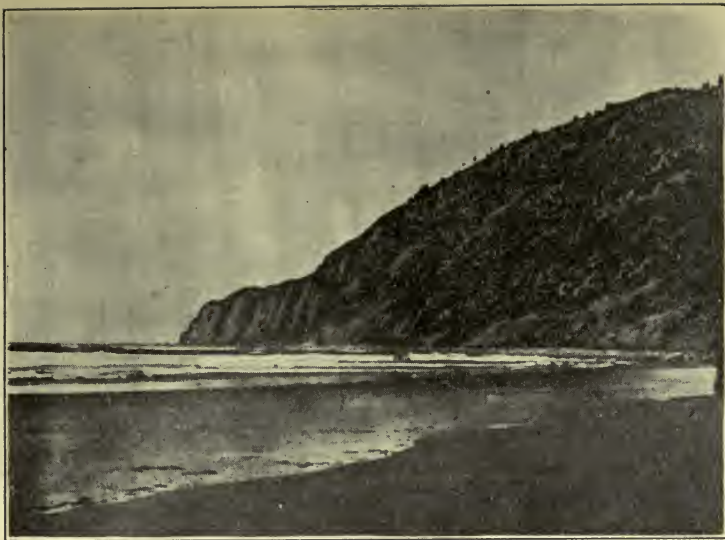
Upper end of Nehalem spit, where beeswax was found.