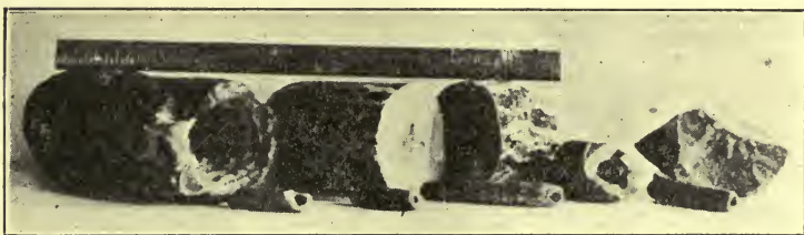
Pieces of candles in possession of writer. The fragment at the left side of the picture has a conical hole in the base for the reception of a peg or candle-stick to support it while in use.