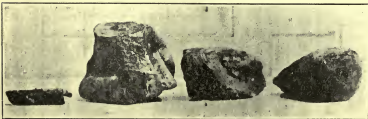
Fragments of candles. Portland City Museum.