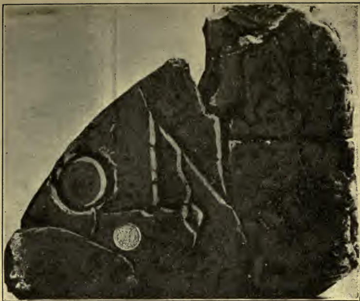
Large cake of Nehalem wax, showing engraved character. This cake, when whole, measured about 20 x 6 x 16 inches. Portland City Museum.